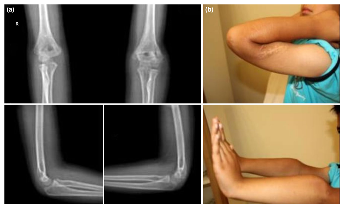
Figure 3. (a) Anteroposterior and lateral X-ray images of left and right elbow at one-year follow-up. (b) Full flexion and extension of elbow of our patient at five-year postoperative follow-up.

openly. Fixation was made with one medial and two lateral crossed Kirschner-wires (K-wires) under a C-armed fluoroscope (Figure 2a).