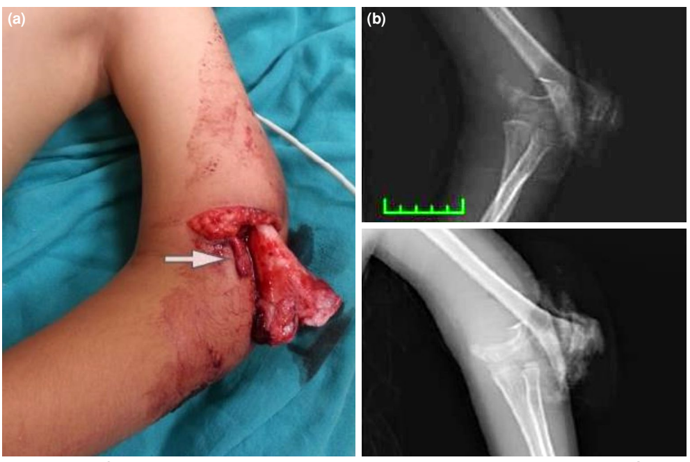
Figure 1. (a) Supracondylar humerus fracture classified as type IIIA according to the Gustilo-Anderson criteria. The radial nerve is visible and marked with a white arrow. (b) Preoperative X-ray of our patient classified as a Gartland criteria type IV and Gustilo-Anderson criteria type IIIA.

the periosteum and the radial nerve was totally cut. The left humeral distal region and the radial nerve were in contact with the external environment (Figure 1a). Radiographs were taken of the patient's elbow, and the patient was evaluated as having a Gustilo Anderson type IIIA and modified Gartland type IV left supracondylar humerus fracture, and the direction of the distal part was posteromedial (Figure 1b).