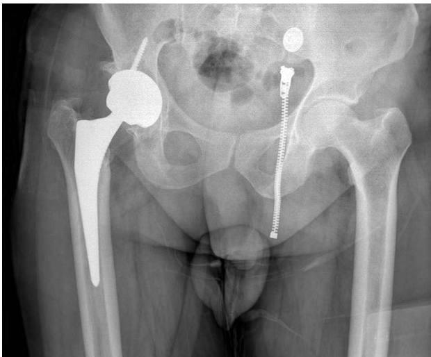
Figure 3. Anteroposterior pelvis radiograph of the patient at the last follow-up visit.

an acceptable range. We terminated the antibiotic treatment after discussing with infectious disease specialists, discharged the patient home, and planned regular follow-up visits.