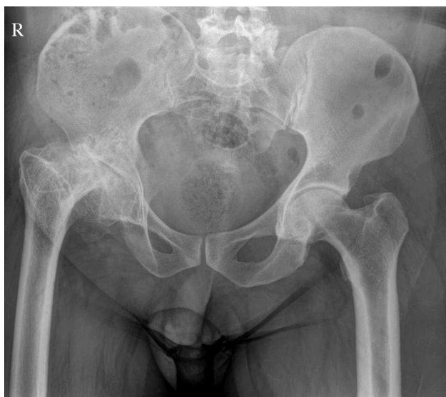
Figure 1. Anteroposterior pelvis radiograph of the patient at first presentation.

While culture results were pending, IV teicoplanin was administered. The cultures taken during the operation produced the same pathogen on the fifth day of incubation. Colistin and meropenem treatments were started by strictly following renal functions and adequate hydration. Subsequently, on the 15 th day of treatment, serum creatinine and urea levels increased rapidly. The colistin treatment was paused despite high infection parameters and continuous surgical site discharge. After renal function tests returned to the basal level, a new treatment regimen was tailored by infection disease specialists, adding rifampicin to the current meropenem treatment with appropriate dose adjustment to the renal clearance rate. The following four weeks were uneventful. The CRP levels declined from 120 mg/L to below 10 mg/L gradually (Figure 2). Except for the interim negligible wound discharge, the patient was stable. At the end of four weeks of IV antibiotic treatment, there were no issues in the wound and no pain around the surgical site. The patient mobilized independently. All biochemistry panels and CBC were within