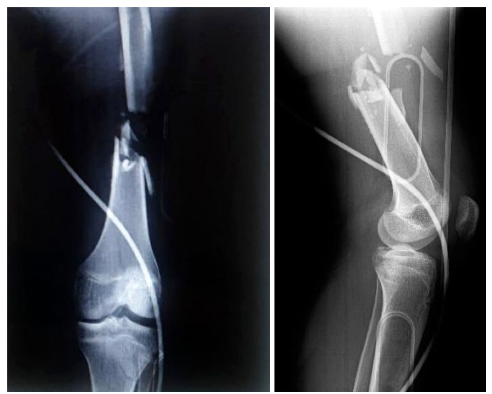
Figure 1. Anteroposterior and lateral radiographs of the femur fracture, showing the loss of a long bone segment.

Osteomyelitis has not developed since the five-year follow-up of the patient. At the three-year follow-up of the patient, it was observed that the fracture was over-healing (Figure 3). A written informed consent was obtained from the patient for the publication of this case report.