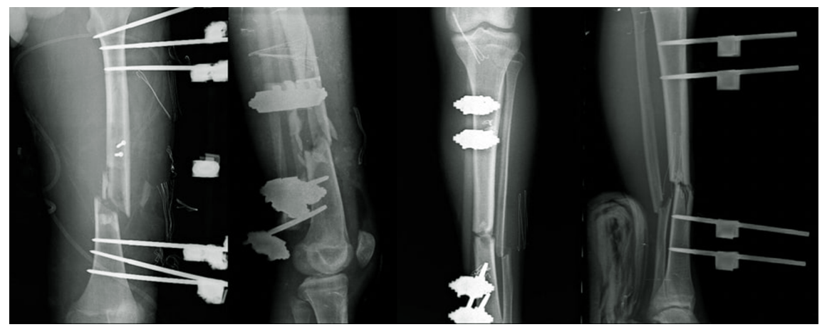
Figure 2. Immediate postoperative femur and tibia radiographs of the monolateral external fixator for floating knee injury. Autoclaved bone segment is fixed to the proximal fragment.