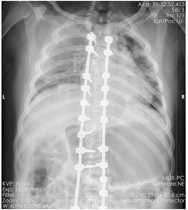
Figure 1. Anteroposterior radiograph of the spine showing lateralized screws at the left T3 through T8 segments.

any issues on the first postoperative day, and an anteroposterior X-ray of the spine showed lateralized screws at the left T3 through T8 vertebral segments (Figure 1). The patient developed shortness of breath on the second postoperative day, and a CT scan was requested, which confirmed that the screws were lateralized and revealed that the patient had already developed left hemothorax. The patient was urgently evaluated by thoracic surgeons, and the possibility of a ruptured esophagus or segmental artery bleeding was considered. The patient underwent esophagography, and no leakage was observed in the esophagus (Figure 2). Afterward, the patient's hematoma was surgically drained, and the patient stabilized after this procedure. The patient was mobilized on the second day after the drainage.