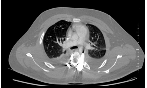
Figure 3. Computed tomography image displaying the contact of the left T4 screw with the aorta.