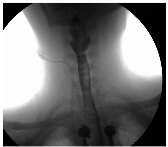
Figure 2. Esophagography demonstrating the absence of leakage in the esophagus.

any issues on the first postoperative day, and an anteroposterior X-ray of the spine showed lateralized screws at the left T3 through T8 vertebral segments (Figure 1). The patient developed shortness of breath on the second postoperative day, and a CT scan was requested, which confirmed that the screws were lateralized and revealed that the patient had already developed left hemothorax. The patient was urgently evaluated by thoracic surgeons, and the possibility of a ruptured esophagus or segmental artery bleeding was considered. The patient underwent esophagography, and no leakage was observed in the esophagus (Figure 2). Afterward, the patient's hematoma was surgically drained, and the patient stabilized after this procedure. The patient was mobilized on the second day after the drainage.