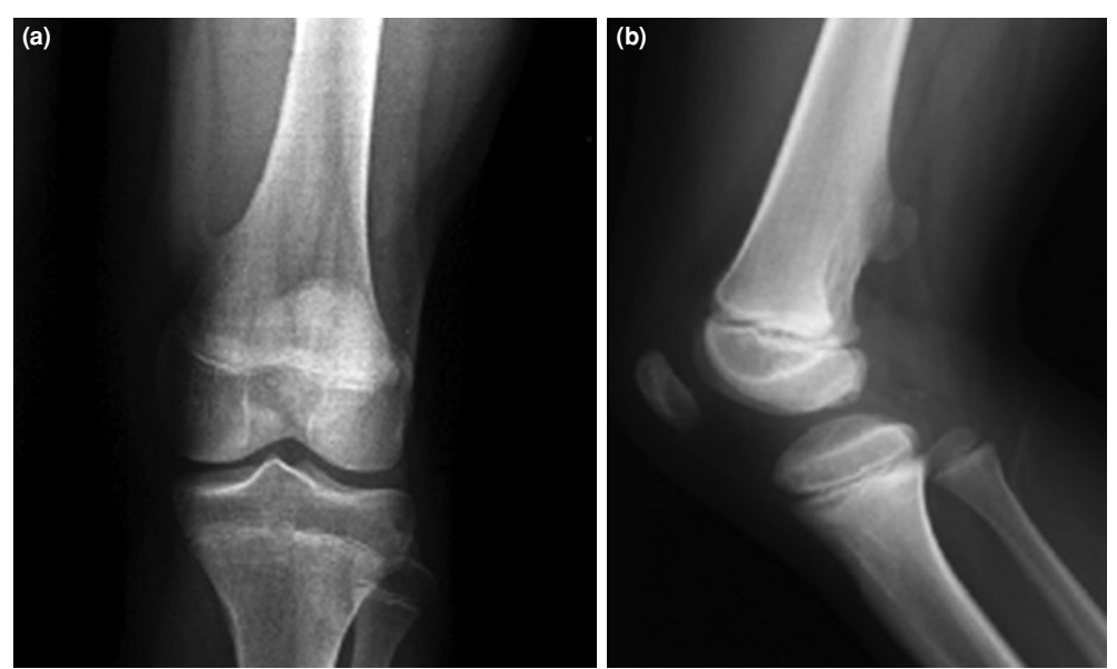
Figure 3. At the first follow-up (Month 3), (a) anteroposterior and (b) lateral X-rays of distal femur.

diaphysis region (Figure 1). Magnetic resonance imaging (MRI) demonstrated an osteochondroma located at the distal medial part of the femur. On axial and coronal fat-saturated proton-density images, a mildly increased signal intensity was detected in the vastus medialis muscle supporting the diffuse soft tissue edema and partial rupture, including 10% of muscle fibers. The coronal fat-saturated proton-density images also demonstrated the hypointense hemorrhagic millimetric areas (Figure 2).