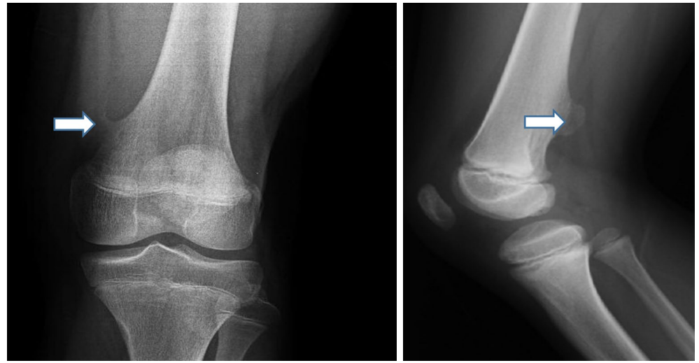
Figure 1. Anteroposterior and lateral X-rays of distal femur showing exophytic lesion (arrows).

with palpation. In addition, there was a minimally local swelling in this area. Muscle weakness in the quadriceps was observed as 4/5 due to the pain. There